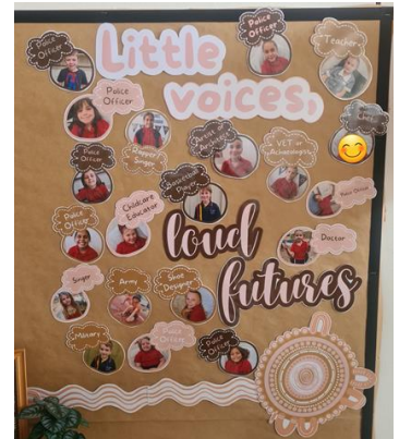
SNAICC – National Voice for our Children (Aboriginal and Torres Strait Islander Corporation)